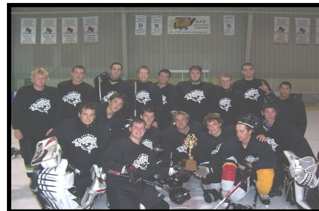
2010 SUMMER HOCKEY LEAGUE CHAMPS

The league will start on Monday, May 30, 2011